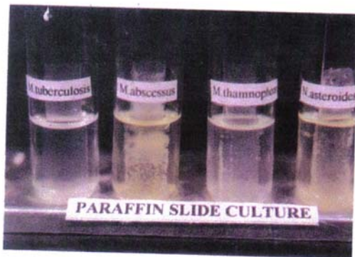
Fig.1 Paraffin slide cultures showing growth of NTM ( M.abscessus -2, M.thamnopheos -3 & N.asteroides -4 but no growth of M.tuberculosis -1)

In order to judge whether the system could be used also for speciation of NTM. M.kansasii ,